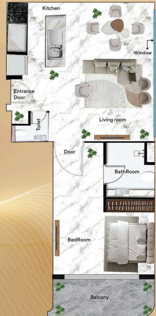
1-Bedroom Type A