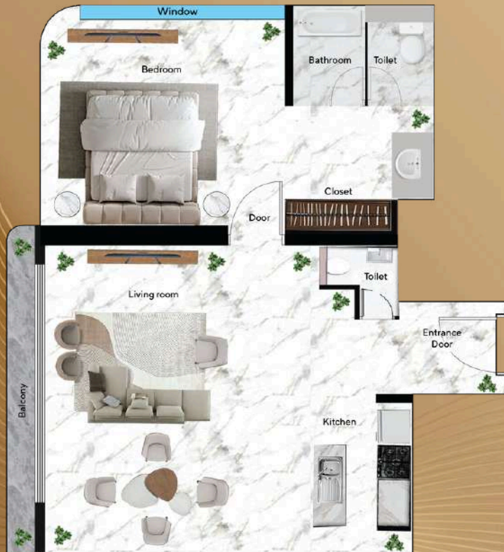
1-Bedroom Type D