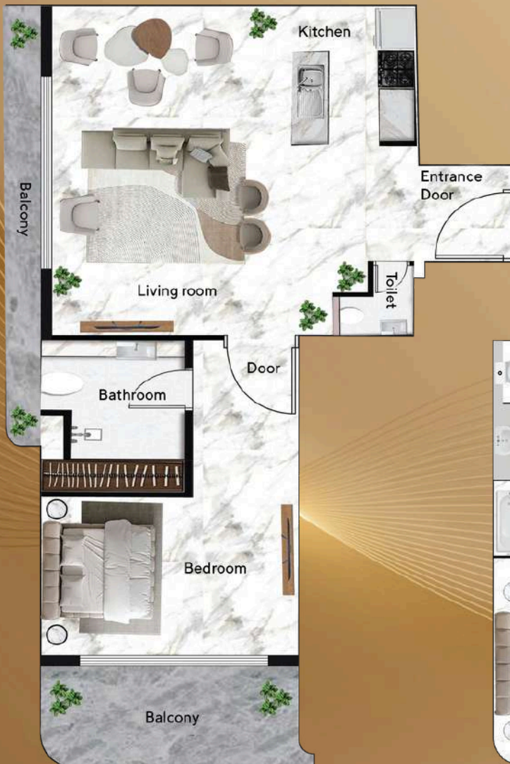
1-Bedroom Type C